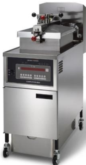
PFG 600 gas pressure fryer with Computron™ 8000 control

Henny Penny first introduced commercial pressure frying to the foodservice industry more than 50 years ago. Frying under pressure enables lower cooking temperatures for longer oil life, and faster cooking times to meet peak demand. Pressure also seals in food's natural juices and reduces the amount of oil absorbed into product.